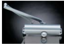
Heavy Duty Automatic Closer