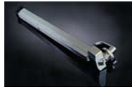
Panic Device with Lever